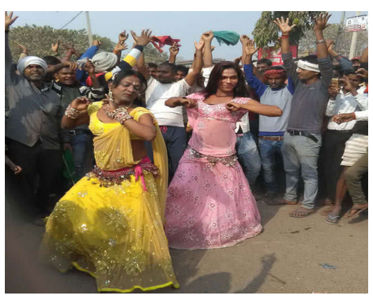
Figure 6. Launda Dance

Apart from the allegations of exploitation of the female actors in the Bhojpuri natak or nautanki performances, there is another category of actors who faced almost similar treatment like the women actress in the nautanki theatre. The effeminate male actors who sometimes played dance numbers in the nautanki or natak performances, were popularly known as launda. These transgender actors are engaged in several celebratory traditionally occasions in north India. Their dance is popular during marriage ceremonies, child-birth and several festivals like Holi, Diwali or Chhat in Bihar. The 'laundas' or transgender personsare used for sexual pleasure by a certain group of people. These practices areundertaken secretly and behind the closed doors of landlords or moneylenders or political leaders. Though sometimes it becomes an