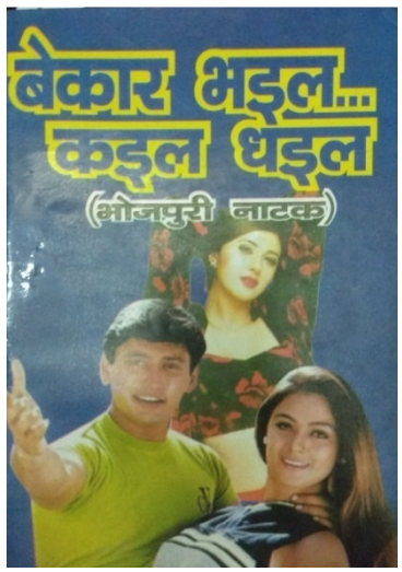
Figure 4.Bekaar Bhail Kail Dhail (Picture: cover)

Bekar Bhail Kail Dhail (To hold something is useless) is a popular Bhojpuri nautanki which carried all the elements of a popular Hindi film in the 1990s. B.S. Tiwari, of the Baraon village in