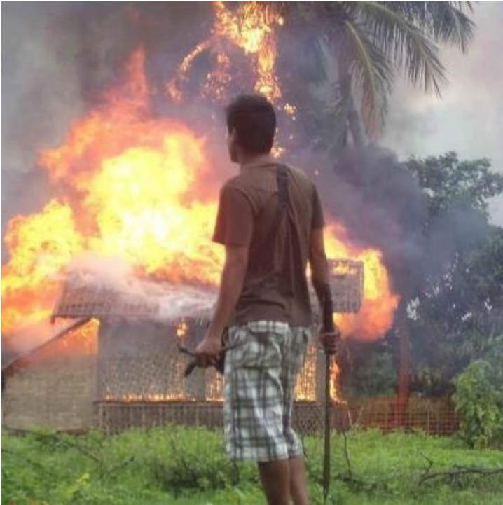
Armed Rakhines await after setting fire of Rohingya houses-