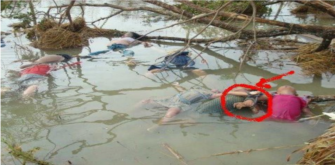
The dead bodies of a group of Rohingyas including kids, believed to be shot dead on broad}

Only a few thousands able to escape and the death toll of Rohingya passed more than (10,000) from Sittwe town alone and a few thousands covering Maungdaw, Rathedaung and Kyauktaw townships. Most of them were shot dead, brutally beaten to death, burnt alive and killings of thousands of the rest of those taken away by security forces into hidden areas. In the meantime, police authority are arresting Rohingya elders and youths from every village of Sittwe, Maungdaw, Rathedaung and Kyauktaw townships and framing them with false charges. The dead bodies of more than 10,000 Rohingyas were completely hidden. Some dead bodies found around the graveyard, remote areas and floating along the beach were also not allowed to burry. The government is worry the Rohingyas could gather some evidence therefore confinement in placed.