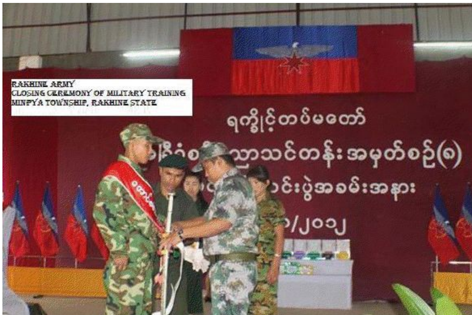
Government allows Rakhine community to have own Rakhine army forces

On 16 Feb 2013, The Burmese government supplies ten guns to each Rakhine village in Northern Maungdaw. The Arakan Liberation Party (ALP) and Rakhine National Development Party (RNDF) formed a youth group having a leader to every Rakhine village who are under training with gun and long swords to attack Rohingya at any time. 11