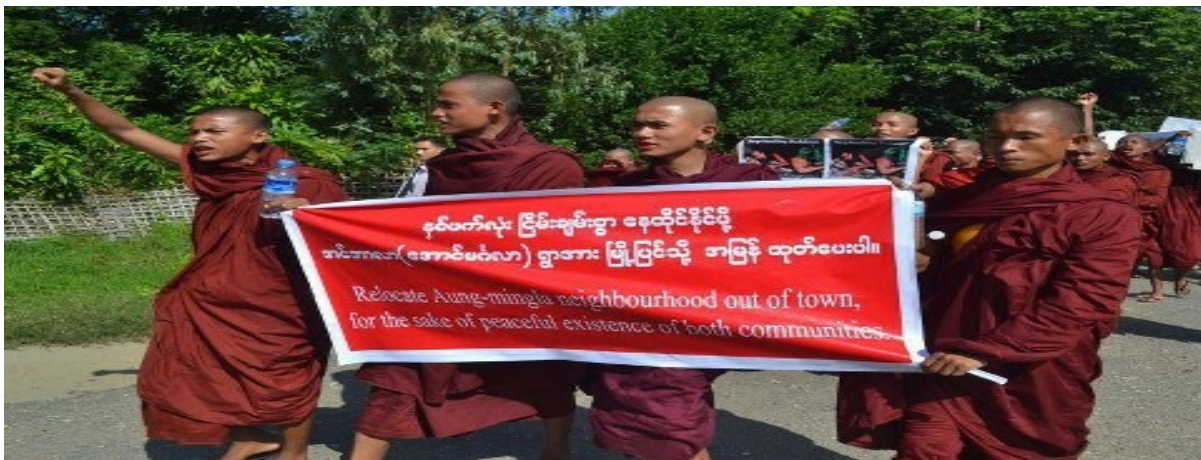
{In Oct 2012, Continuous protests asking the remaining Aungmingala Quarter to be relocated outside the Sittwe town. Another sign also asks to expel the Rohingya villages near the new college that in deed build on the farming lands of Rohingya of Furan Fara and opened from year 2000.}

The condition of very few Rohingyas, Kamans and Rakhine muslims living in the other regions of Kyauktaw, Rambre, Mrauk Oo, Minbya, Myebon, Pauktaw, Kyaukpu townships is unknown. UN Organizations do not have formal contact with these regions. Primarily, their lives and survival are much in the hands of local Rakhines and authorities. While the government officially banned food supply.