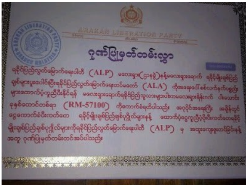
2 3: (designation letter of ALP for financing for emergency arms)

the project of 669 homes for homeless Buddhist refugees is being implemented at Sat Ro Kya Creek area which is former place of Nazi village situated along the creek.