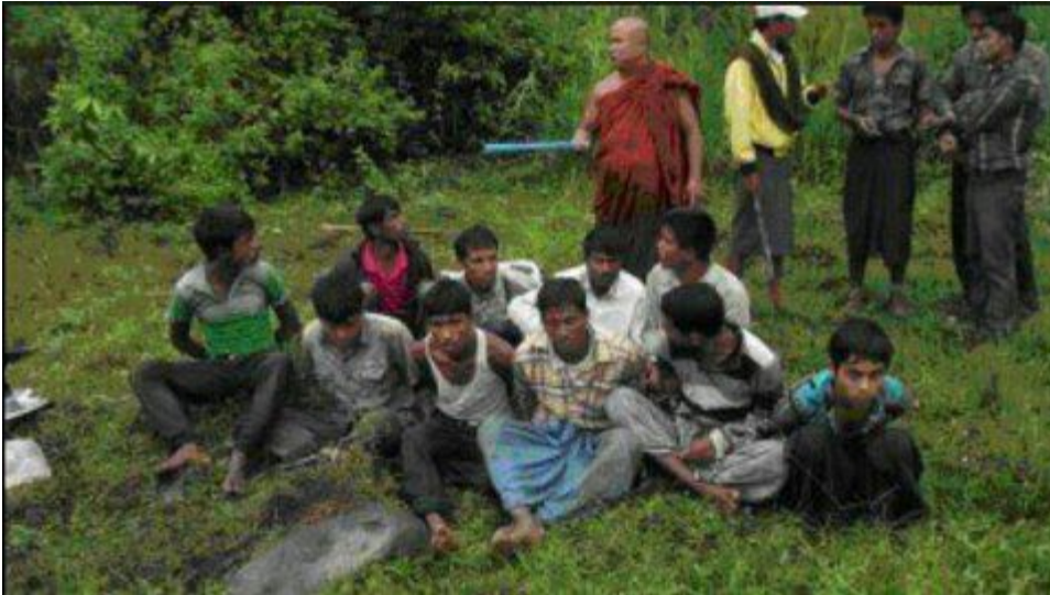
A group of Rohigyas surrounded in Kalay town of Sagaing Division

There are total about 150 Rohingyas involving 52 persons were arrested in Kalay town from June 2012 and all are still detained in Mon Rwa Prison of Sagaing division. According the source, all of them were arrested by by a newly formed organization call the Myochit Lungay Aphwe (Loyalist Youth Association) and handed over to police authority.