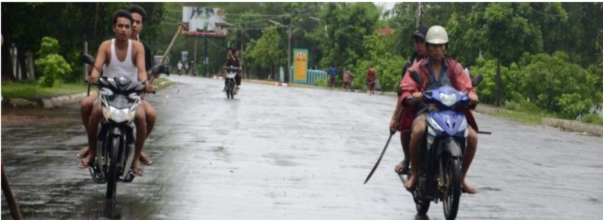
Rakhines holding weapons during declaring of Act Of Law 144 inside the Sittwe town

From the beginning, the government authorities did not install Curfew and Order on aggressive Rakhine people who are openly doing crimes. As well as, the local armed forces who were acting as security forces are allowed to shoot Rohingyas. It was almost one month from 8 June, the Rohingyas of Sittwe and secondly Rathedaung and thirdly Maungdaw towns were heavily attacked by both Rakhines and government security forces.