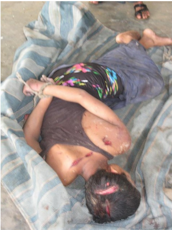
2 3: brutally killing after tied-up

RNDP party openly declared the bounty reward for every dead Rohingya. He openly declared the displaced Rohingyas to sign the documents that state that they are illegal immigrants that have no claim to Burmese citizenship therefore to deport the Rohingya. When the Rohingya in the camp refused to sign the documents, the authority threatened the Rohingya victims that no signing would no aid ever made it through the blockades again including aid from foreign organizations. With cooperation of the governemtn, the RNDP has also begun encouraging Rakhine from Bangladesh and impoverished areas of the Arakan to move into Rohingya villages. While homeless Rohingya victims are not allowed to relocate on their lands, the authorities are planning to locate Rakhine people on the Rohingya people' lands by constructing new houses. From early February 2013, the project has been under scope and an Arakan state lawmaker from Sittwe U Aung Mra Kyaw said the project of 669 homes for homeless Buddhist refugees is being implemented at Sat Ro Kya Creek area which is former place of Nazi village situated along the creek.