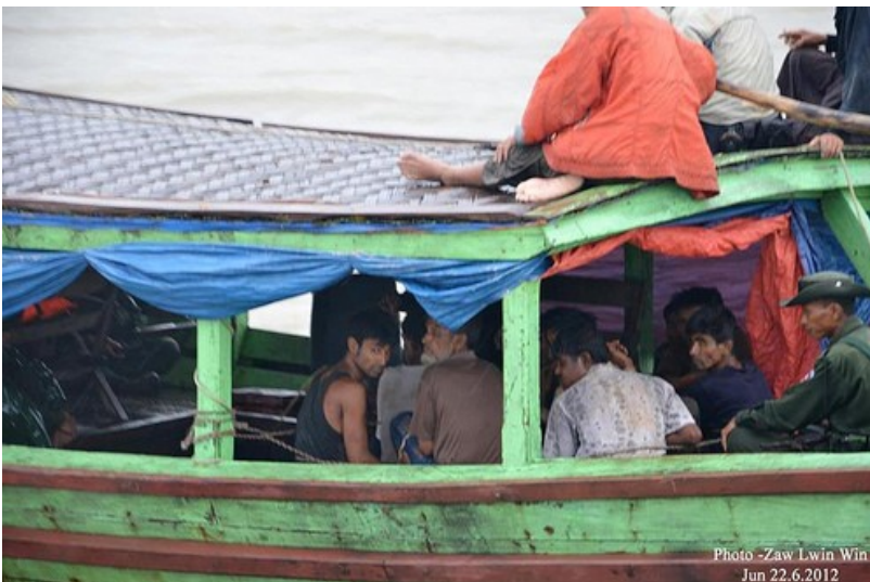
Taking away Rohingyas in one of the occasions

Only a few thousands able to escape and the death toll of Rohingya passed more than (10,000) from Sittwe town alone and a few thousands covering Maungdaw, Rathedaung and Kyauktaw townships. Most of them were shot dead, brutally beaten to death, burnt alive and killings of thousands of the rest of those taken away by security forces into hidden areas. In the meantime, police authority are arresting Rohingya elders and youths from every village of Sittwe, Maungdaw, Rathedaung and Kyauktaw townships and framing them with false charges. The dead bodies of more than 10,000 Rohingyas were completely hidden. Some dead bodies found around the graveyard, remote areas and floating along the beach were also not allowed to burry. The government is worry the Rohingyas could gather some evidence therefore confinement in placed.