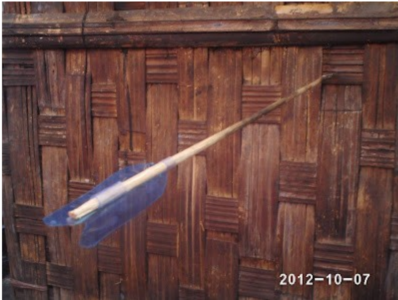
(one factory made arrow hit at the bamboo wall of a Rohingya house)

The worst is that Rohingya, Kaman and Rakhine muslims of all over Arakan state are also facing food shortage from the beginning as a result of the government still impose confinement onto them.