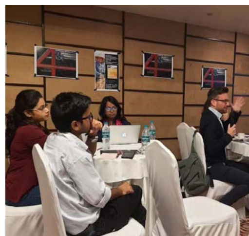
Participant interaction in the question and answer session of the panel