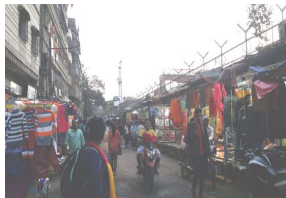
Bichali Ghat in Garden Reach area