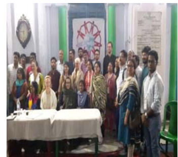
Participants interacting with students and activists from the locality