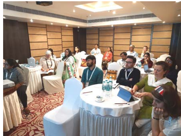
Presentation of research papers by workshop participants of Module F: Laws of Asylum and Protection