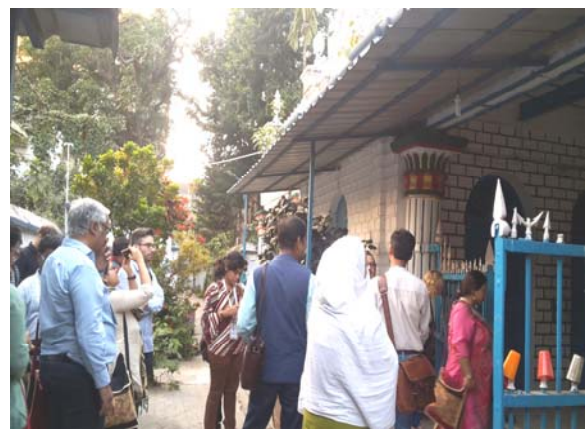
Workshop and Conference participants inside the Shahi Masjid premises in Metiabruz, Kolkata

The third stop was Bichali Ghat on the bank of river Hugli that offers morning to evening ferry service from the east bank to the west bank of the river connecting the neighbourhood of Metiabruz in the western part of the city of Kolkata to Howrah. The jetty is renowned for the transshipment of bamboos that come floating to the bank from different Indian states. There is an idol immersion and bathing ghat alongside the ferry service gate that has carcasses of immersed idols standing. The lane that led away from the jetty towards Garden Reach Road was lined by kite-making shops, textile and clothing shops, and shops selling steel and aluminium utensils and household accessories – professions that dominate the local market practised mostly by many Muslim families who had migrated to the area during Indian independence.