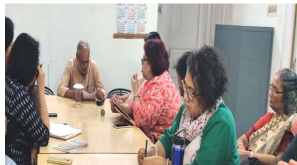
Audiences of Ranabir Samaddar's public lecture