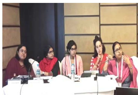
Presentation of research papers by workshop participants of Module A: Global Protection Regime for Refugees & Migrants and Module B: Gender, Race, Religion & other Fault Lines in the Protection Regime