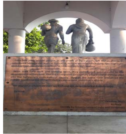
Plaque and statue commemorating the sail of indentured labour from British India 1873 onward