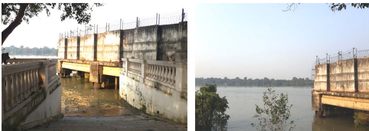
Suriname Ghat locally known as Balu Ghat in Garden Reach area in Kolkata