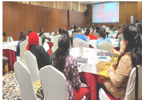
Presentation of research papers by workshop participants of Module E: Statelessness