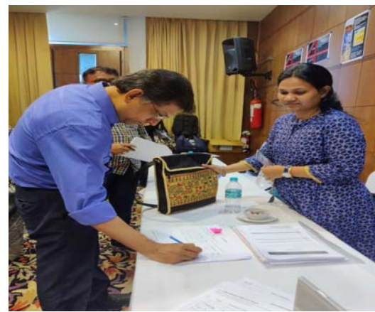
Preparations at the CRG office for the workshop and conference