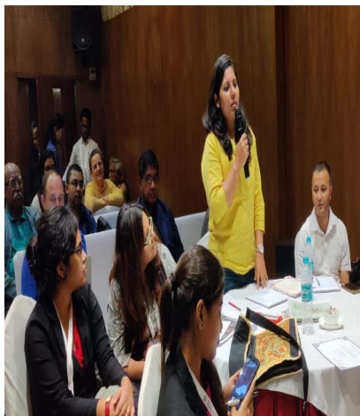
Remarks by workshop participants