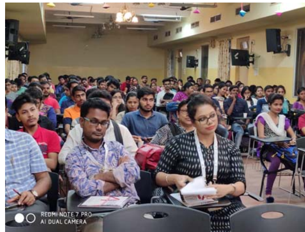
Audiences of Ravi Palat's public lecture