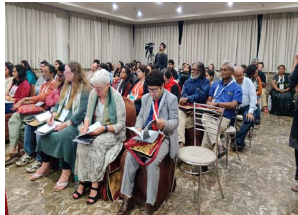
The Inaugural Session of the Fourth Annual Research and Orientation Workshop on Global Protection of Migrants and Refugees on 25 December 2019