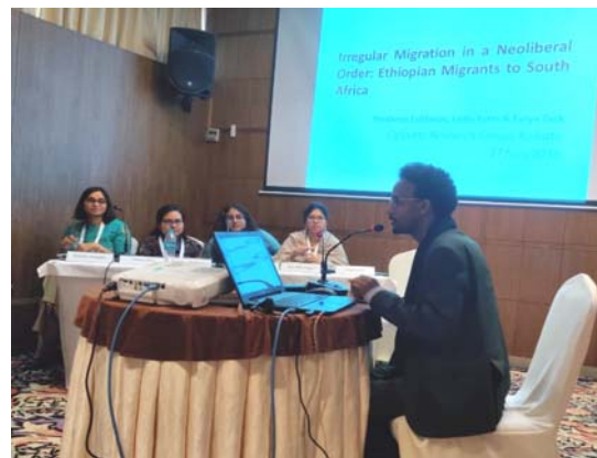
Presentation of research papers by workshop participants of Module C: Neoliberalism, Immigrant Economies and Labour