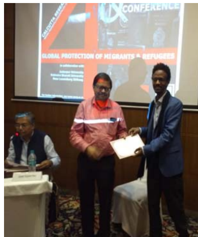
Certificate distribution ceremony