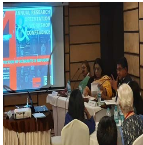
Panel on ‘Conflict and the Future of Global Protection Mechanism’, 29 November 2019