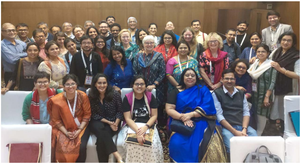
The Research Collective