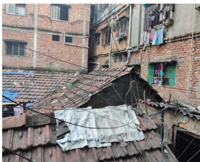
A glimpse of the slum from the school window

After the partition of 1947, the jute producing areas of Bengal which supplied raw jute for the industry became part of East Pakistan (now Bangladesh). A majority of the jute mills were located in West Bengal. As supply of raw jute dried up, many jute mills in the western half of Bengal faced a shut down. Eventually over the span of the next few decades the Howrah jute mills were closed down and the areas with the industrial units were bought up for real estate development. After the factories were closed, many of the descendants of the Howrah jute mill workers have found work in the informal sector. Their slum remained and over the years the ownership of the slum land was vested in the state. The Priya Manna Bustee is now a registered slum. But building activity inside the slum has continued informally without following municipal regulations. Amenities, infrastructure and environmental condition in the slum are poor, with extreme overcrowding, inadequate drinking water and very poor sanitation, drainage and waste disposal.