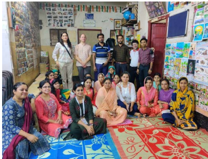
Workshop participants and community members in Talimi Haq School, Howrah

The community members also discussed issues of intercommunity relations. While the Priya Manna bustee is a Muslim settlement, there are Hindu settlements just next to it. There are multi storied apartments owned by Hindus and also a Hindu working class settlement close by. Earlier members of both communities had shared cordial relations. It was customary for them to participate in each other's festivities. For the past few years there have been some tensions.