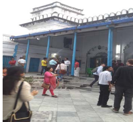
The group at Sibtainabad Imambara in Garden Reach

The interaction brought to light the changing socio-economic and demographic composition of local population. Residents of the neighbourhood while conversing with the participants at the Imambara highlighted the co-existence of all religious faith and workers in the organised and unorganised sectors surviving in peace and harmony. The Metiabruz-Garden Reach neighbourhood is crowded by upper caste Muslims who had settled in the area in large number during Indian independence along with rows of houses of upper and middle-class Hindus – this created pockets of neighbourhood founded on social and religious attributes that are typical to the urban sprawl and architecture in the area.