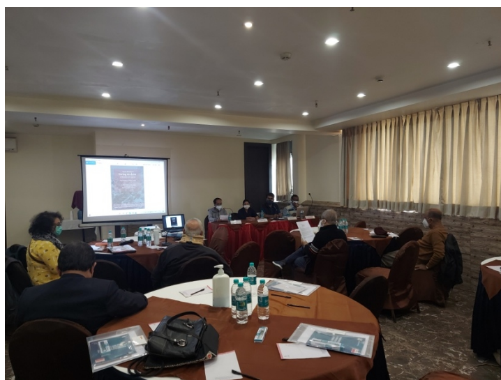
Pic1: Inaugural Session: Living Archive Workshop