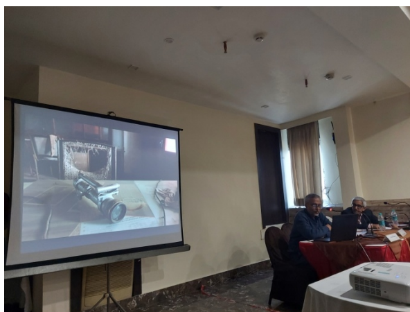
Session 2: New Forms of Archives